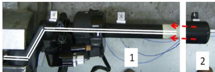
Fig 3: Handlebar: (1) Fixed beam (2) Insertion of steering balance into handle bar extremity [6]

S. Agostoni et al. [6] research work has developed with the aim of investigating motorcycles ride comfort. Particular attention was focused on the handlebar, because this component is directly comes in contact with driver. A well-grounded, repeatable methodology is developed with a proposed view of designing a Tuned Mass Damper (TMD) that should capable of absorbing